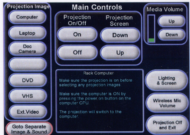
Fig.3: Main screen

If VGA or AUDIO Cables are missing please contact AV Dept. at ext.3051